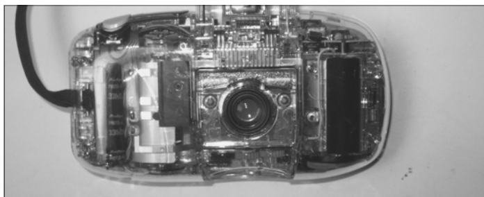
See through Kodak demo camera would make a good “show and tell”

A printed “Show and Tell” could be a regular feature of snap shots . This would enable all our members to view some unique pieces. The story above is one example. You are invited to submit photos and commentary about your favorite photographic items. The editorial staff can assist with the writing. Send your ideas to snapshots@phsne.org or mail to PHSNE, P.O. Box 650189, West Newton, MA 02465-0189. Please include your phone number and/or e-mail address.