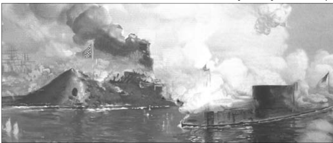
C.S.S. Virginia (left) battles U.S.S. Monitor , 1862

Mariner's Museum, Virginia, Bridgeman Art Library